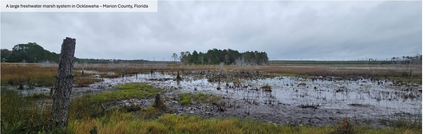
A large freshwater marsh system in Ocklawaha – Marion County, Florida